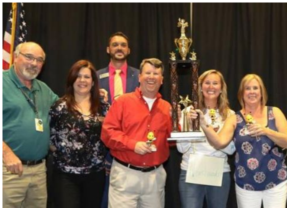
2018 Winners, TCPalm News Hounds