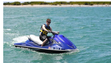
Jet Ski Rentals And More! Book an excursion today!