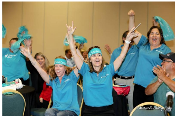
Seacoast Bank cheers at last year's Bee