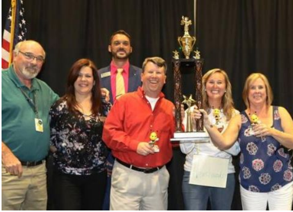
2018 Winners, TCPalm News Hounds