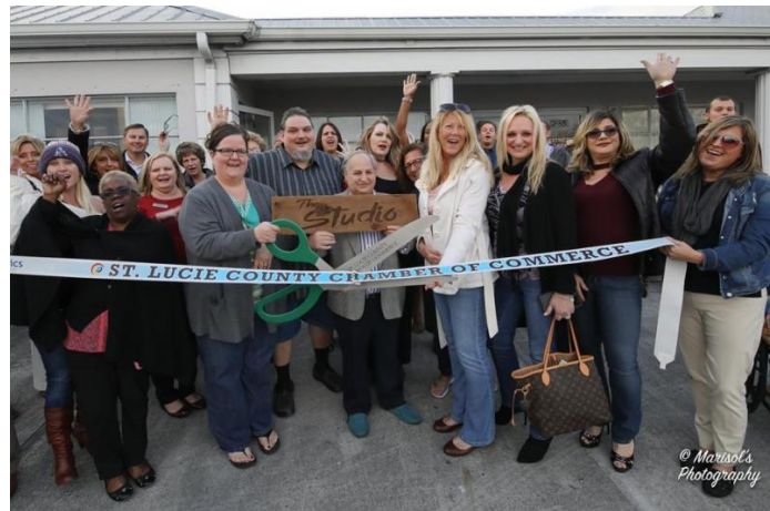
Celebrating WRPBiTV "The Studio"!