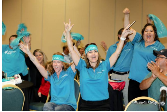
Seacoast Bank cheers at last year's Bee